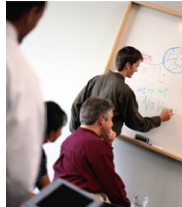
SCORE SE Wisconsin