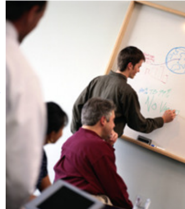
SCORE SE Wisconsin